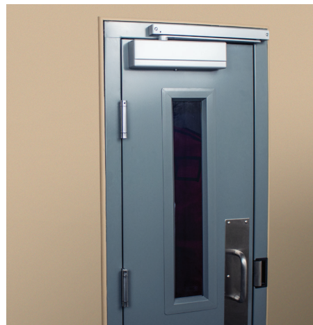
Optional UL Fire Rated doors and return chutes with automatic soft close