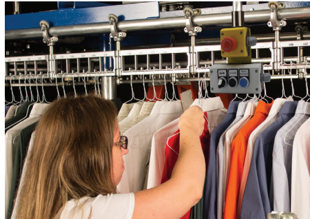
Manual load station