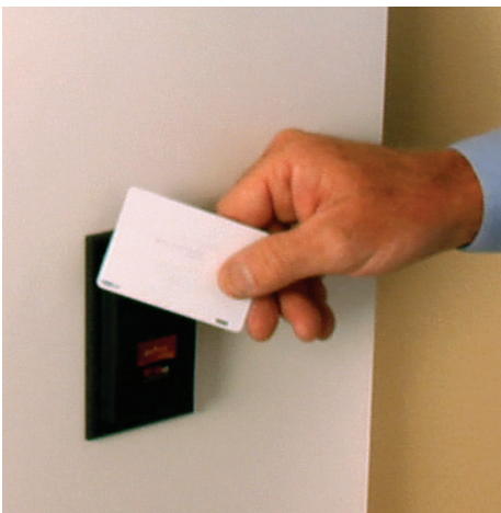
ID card reader