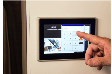
Color touch screen